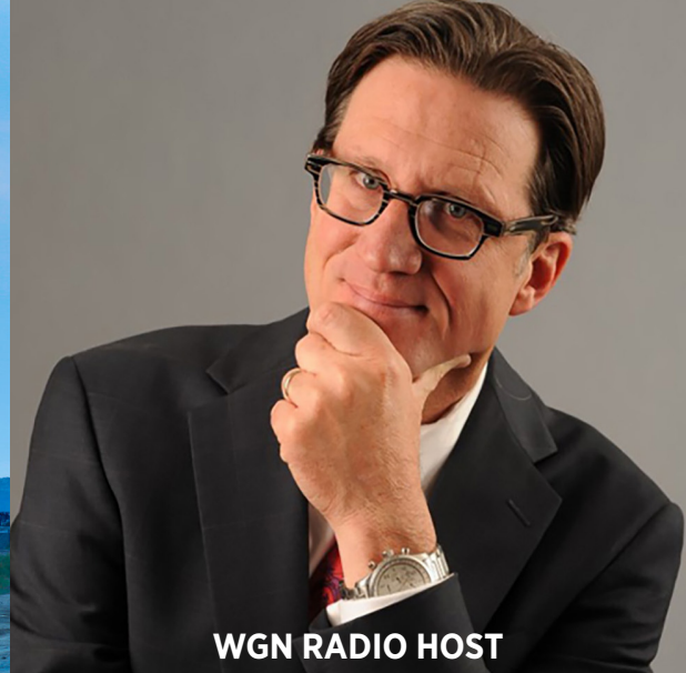
WGN RADIO HOST