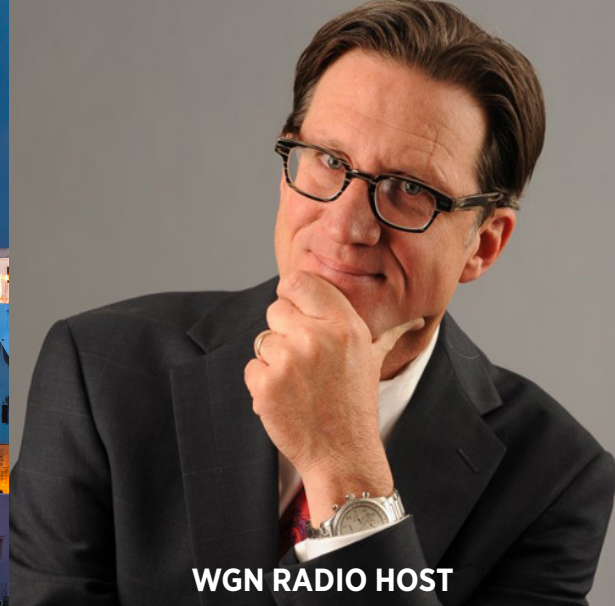
WGN RADIO HOST